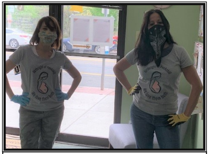
Birthright Volunteers in the office helping during COVID

"Spread love everywhere you go . Let no one ever come to you without leaving happier." -Mother Teresa.